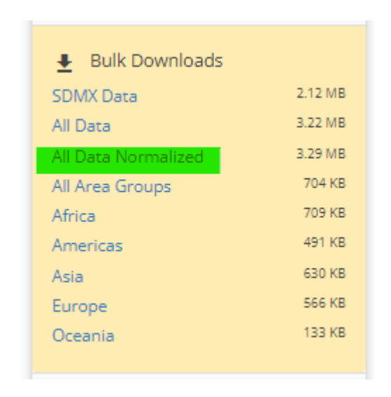
Step 3. Unzip the downloaded file. Open SDG BulkDownloads E All Data (Normalized).csv