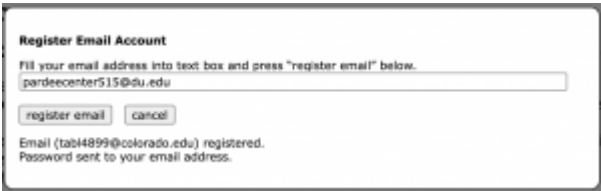
Part 2 of Email Registration in SSP Database