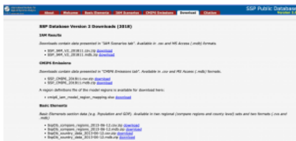
Download Tab in SSP

In the downloads tab, there are a number of different datasets available for download but the one needed for GDP will be found under Basic Elements. The Basic Elements data contains both regional and country dataset and is available in both .csv and .mdb formats. Here, we will only be using the country dataset in the .csv format, titled SspDb_country_data_2013-06-12.csv.zip .