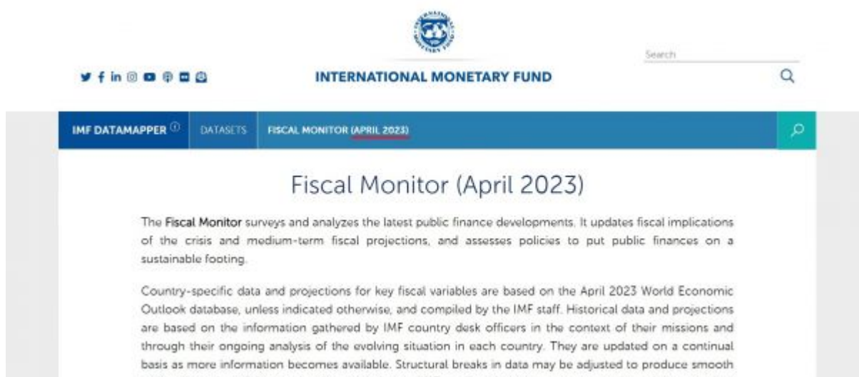
Homepage of IMF Fiscal Monitor Database

Step 1. Navigate to IMF Fiscal Monitor site. Make sure the site is updated by checking the date next to "Fiscal Monitor"