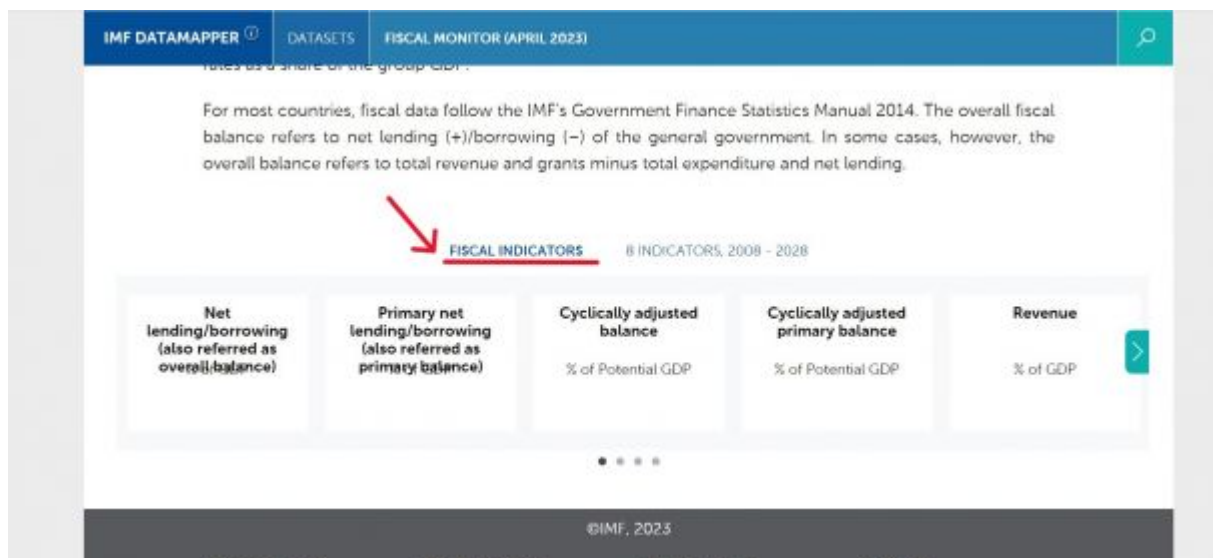
Fiscal Monitor Indicators

Step 2. Scroll down past the text until you reach “Fiscal Indicators” . Click on the arrow on the right side below “Fiscal Indicators” to see additional data.