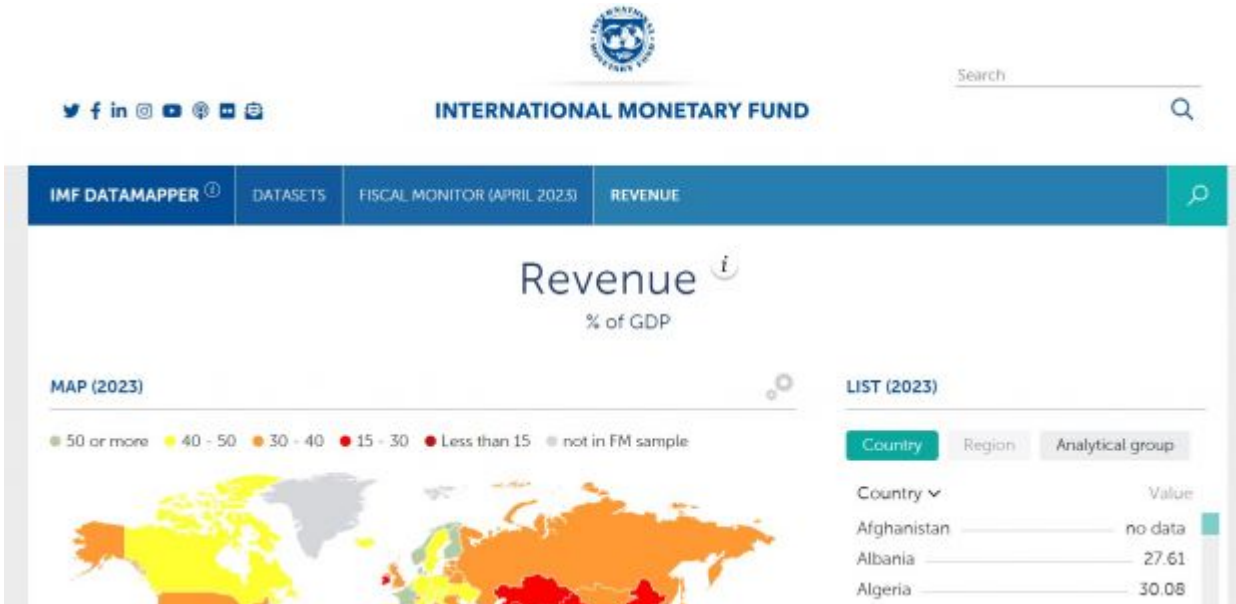
Revenue Indicator Example

Step 5. Scroll down until you reach the bottom of the webpage. There are a few download options but for most cases, you should select “EXCEL FILE” under “All Country Data” . This option will also download all available years.