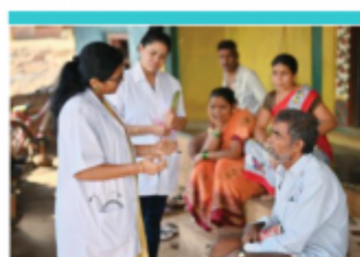
2024 World Population Data Sheet