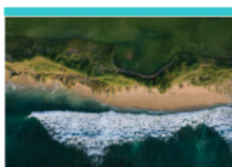
2023 World Population Data Sheet